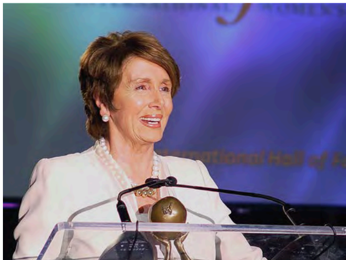
Left: Nancy Pelosi, first woman Speaker of the U.S. House of Representatives

Executive Vice President, Europe, Middle East & Africa, Warner Bros. Consumer Products, Spain